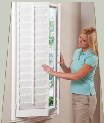
CLOSING SHUTTER PANELS

Use the tilt-rod control in the center of each panel to open and close the louvers.